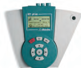
827 pH lab