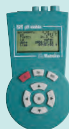
826 pH mobile