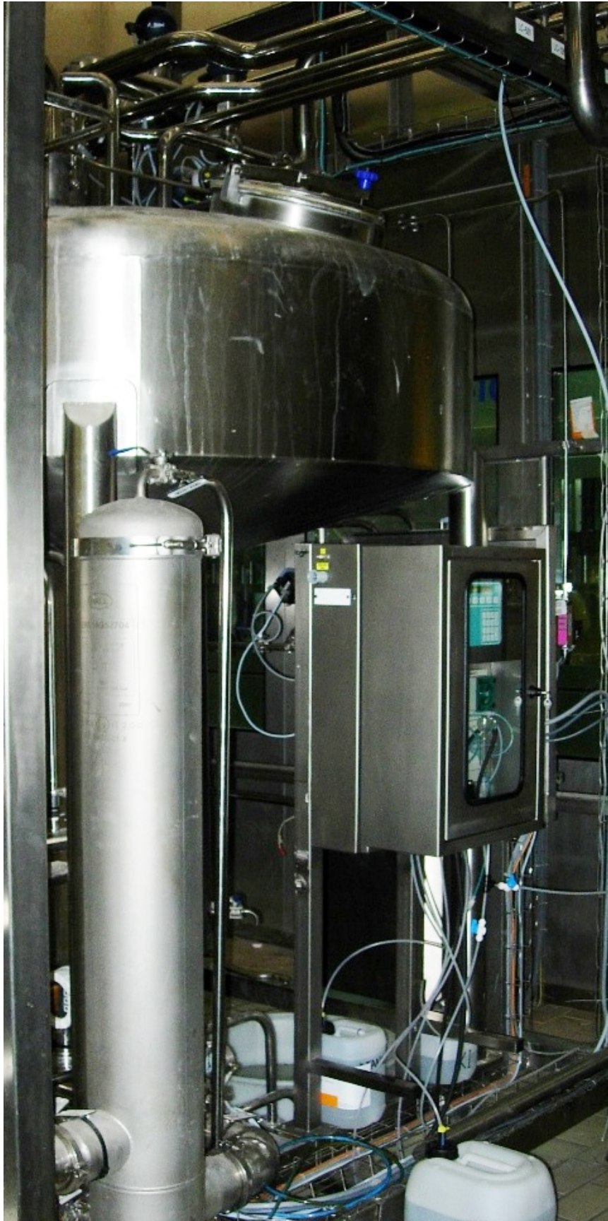
Example. PAA analyser.