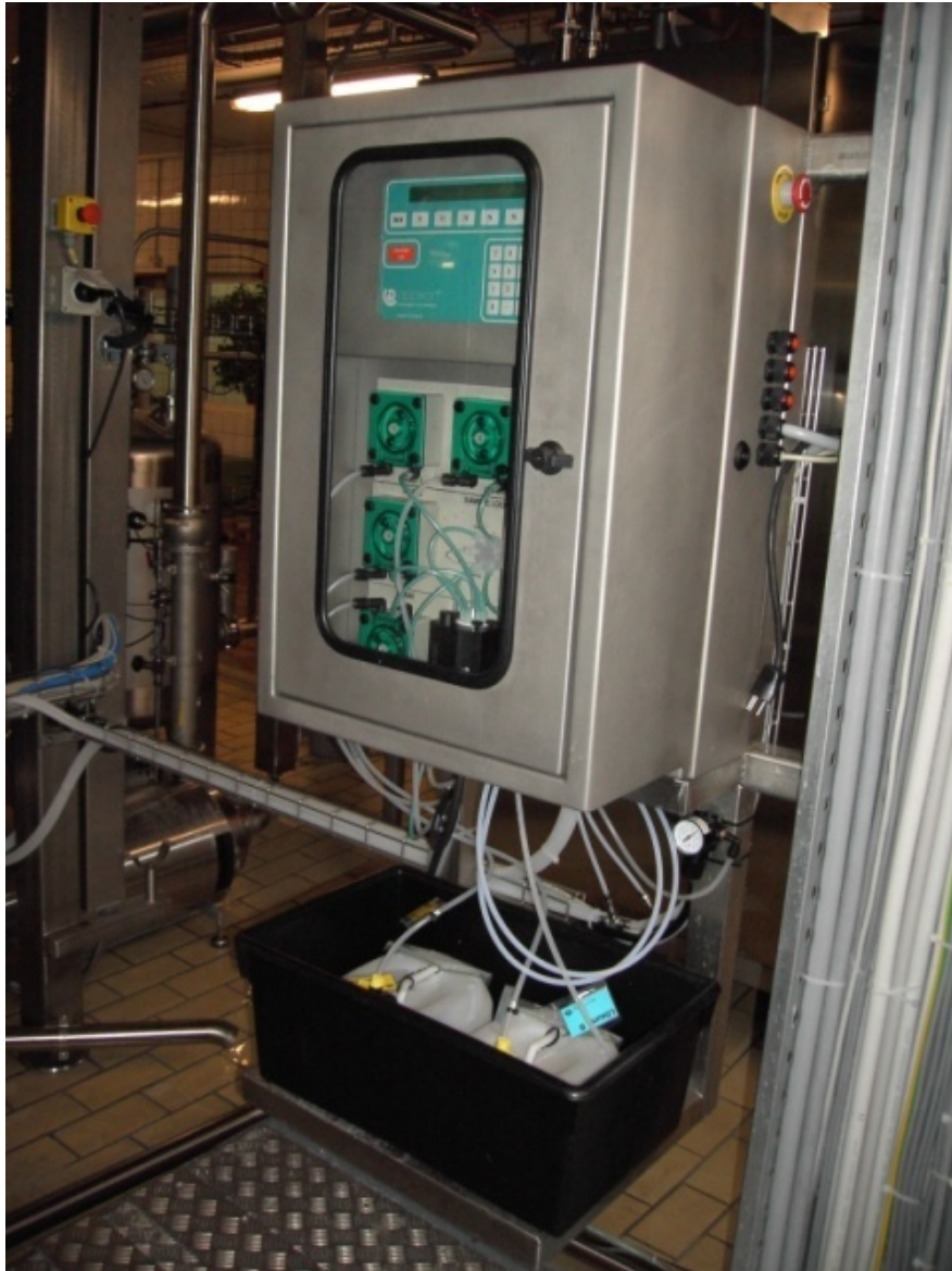
Example. PAA analyser.