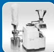
Ultra Centrifugal Mill ZM 200