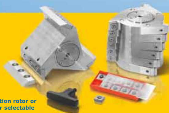
Parallel section rotor or 6-disc rotor selectable