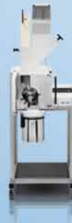
SM 200 the versatile standard model which covers a wide range of applications