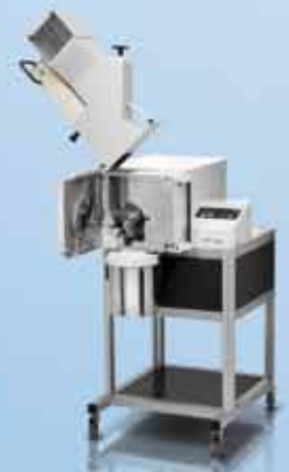
SM 300 the high performance model with variable speed which processes even the most difficult materials