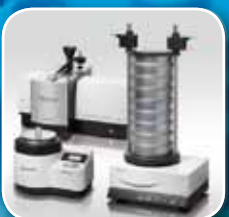
Sieve Shakers / Particle Sizers