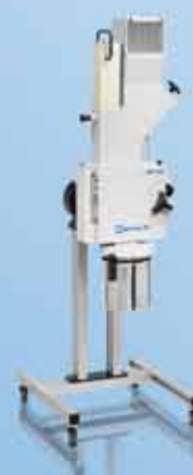
SM 100 the budget-priced basic model for routine applications