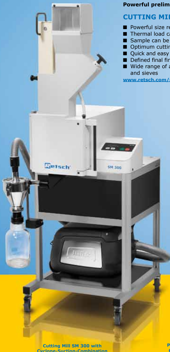
Cutting Mill SM 300 with Cyclone-Suction-Combination