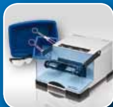
Mixer Mill MM 400 with CryoKit