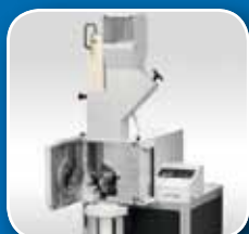
Cutting Mill SM 300