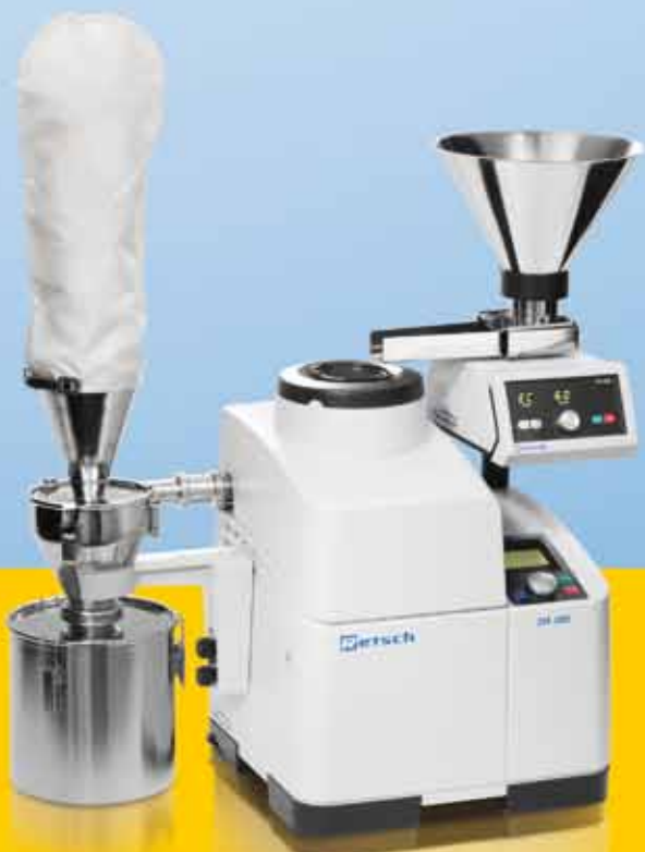
Ultra Centrifugal Mill ZM 200