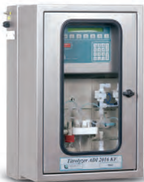
ADI 2016KF Titrolyzer

The ADI 2040 explosion proof Process Analyzer complies with ATEX Zone I and Zone II electrical area classifications. The certified explosion proof version consists of a pressurized stainless steel cabinet together with intrinsic safety electronic devices. This ensures that the integrity of the ATEX certification is always met thereby allowing routine maintenance (wet part section only) to be conducted without the use of «hot work» permit.