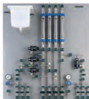
Air pneumatic multi-stream panel