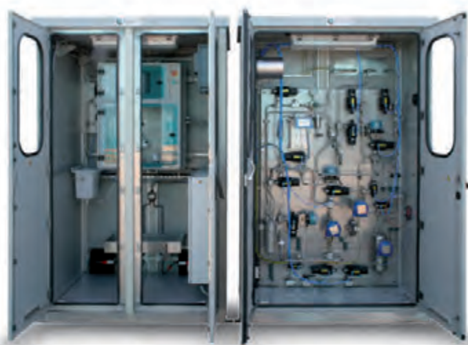
Analyzer shelter with integrated sample preconditioning system

With more than 35 years of experience Metrohm Applikon can provide a complete and exact solution for almost any application. Projects range from one Analyzer in combination with simple sample preparation to complete turn-key packages with shelters, piping, wiring and interfacing. On-site, only the necessary utilities and the sample stream need to be connected, saving a lot of time and energy in the start-up phase of the instrument.