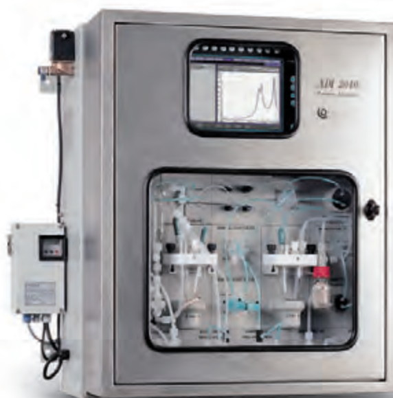
ADI 2040 explosion proof Analyzer