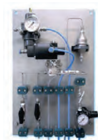
Heavy duty sampling panel