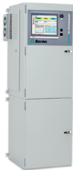
Process Ion Chromatograph