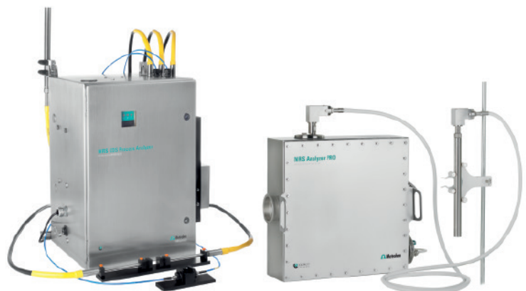
NIRS XDS Process Analyzer