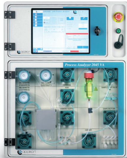
ADI 2045VA Process Analyzer